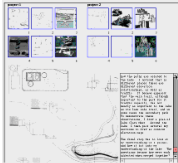
Figure 1: The Architecture Review Page: Clicking on one of the thumbnails shows a larger picture and its associated caption