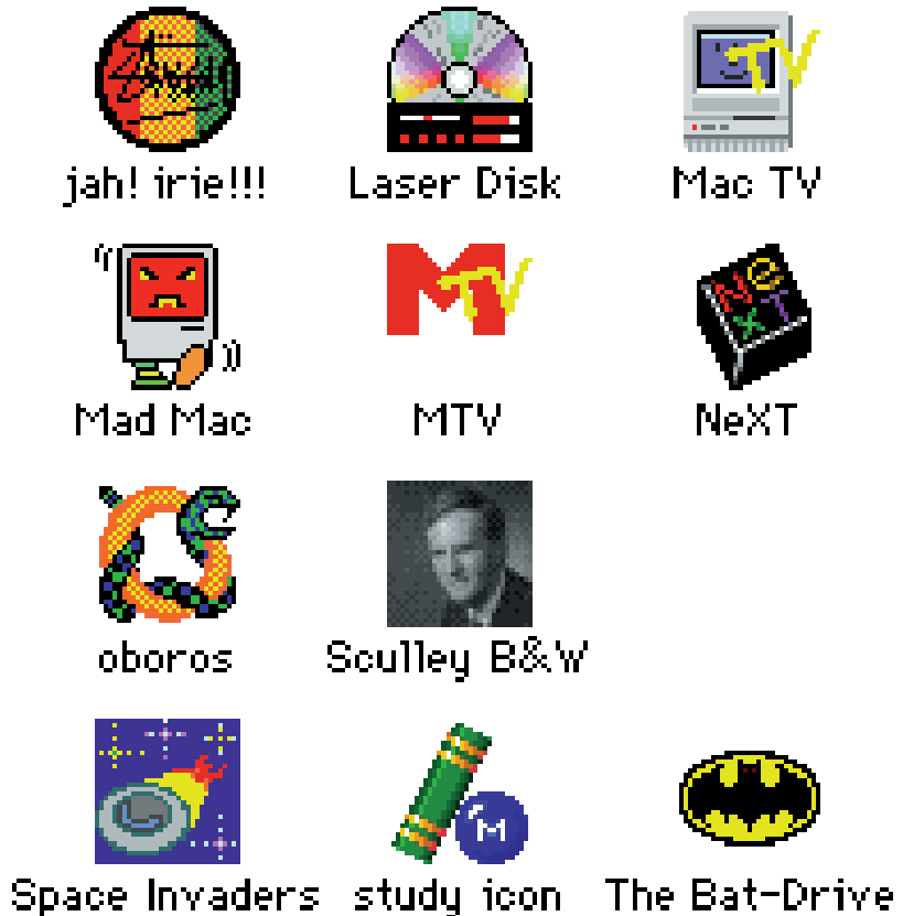
Figure 2. We wish to convert all the PICT files into icons. This task involves several steps and would be very difficult to accomplish with direct manipulation. A simple scripting language provides a natural specification of the task.

A s an example of the limitations of the desktop metaphor, consider the trash can on the Macintosh desktop. It is a fine metaphor for the wastebasket in an office. In both cases we dispose of objects by putting them in the trash can and we're able to retrieve documents we had thrown out until the trash is emptied. However, the limits of the single-trash-can metaphor has led to a system that fails to meet the user's needs and causes confusion by masking the realities of the implementation. In the underlying implementation, there are separate trash containers for each volume, such as a hard disk or a floppy disk, but to avoid the confusion of multiple trash cans in the interface, the contents of the trash containers for all mounted volumes are combined and shown as a single desktop trash can. Because there is only one trash can in the metaphor, if the user empties the trash to create room on a floppy disk, the trash contents on both the floppy and the hard disk are deleted, even though there was no need to delete files from the hard disk's trash can. The desktop metaphor has enforced a limitation on the interface that does not serve the user's real needs. An alternative approach would be to simply cross out files and have them disappear (perhaps to a temporary limbo before being permanently discarded). This approach avoids the problems caused