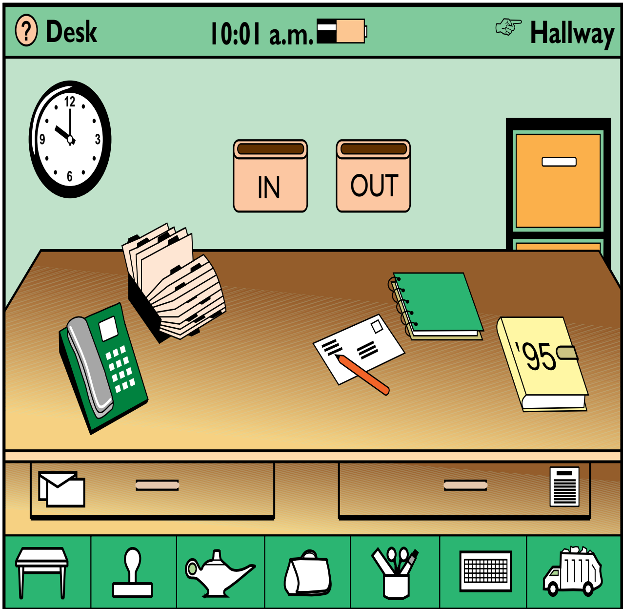
Figure 1. The Magic Cap interface is based on literal metaphors for desktops, buildings, and villages.

each of the Macintosh human interface design principles. We focus on the Macintosh interface because it is a prime example of the current interface paradigm, and Apple Computer has published an explicit list of Macintosh human interface design principles [2]. These principles have not significantly changed since the introduction of the Macintosh; style guides for other popular graphical interfaces, such as Motif, OPEN LOOK, and Windows [16, 18, 22], list a very similar set of principles as the basis for their interfaces.