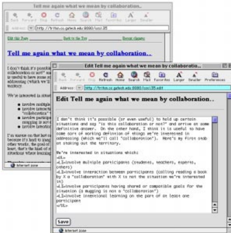
Figure 2: CoWeb page (background) and its "Edit Page" view (foreground).

To provide such functionality, we integrated the Classroom 2000 environment with a tool that would allow Web-based anchored collaboration, CoWeb (Guzdial, 1999a; Guzdial, 1999b). The CoWeb allows any user to edit any page in the website (Figure 2), new pages can be created (and linked) by entering "*New page name*" into a page's text, and old pages can be linked by entering "*Old page name*" into a page. HTML can be entered into the page as desired, or text can just be entered as if the page were an email note. This simple structure has supported a wide variety of collaborative activities, from group writing to telementoring.