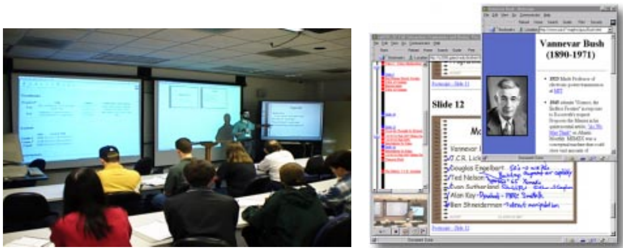
Figure 1: (left) The Classroom 2000 environment with the capturing whiteboard, projectors, cameras and microphones. (right) Web browsers are used for reviewing the captured notes that link presented material from the electronic whiteboard and Web pages visited in class with streaming digital audio/video recorded during class.

We are finding that, when the discussion forum is persistent (e.g., all notes are available at all times, even beyond the scope of the class), the combination of recorded classroom activity and dynamic discussion space leads to the creation of a new kind of learning medium. Any classroom activity can be analyzed, discussed, indexed, and extended indefinitely. In this paper we present our vision for exploiting class activity as collaboratively extensible learning media and discuss results from preliminary experience and evaluation. We conclude with a discussion of how these kinds of forums promote a collaborative learning space that crosses class and classroom boundaries.